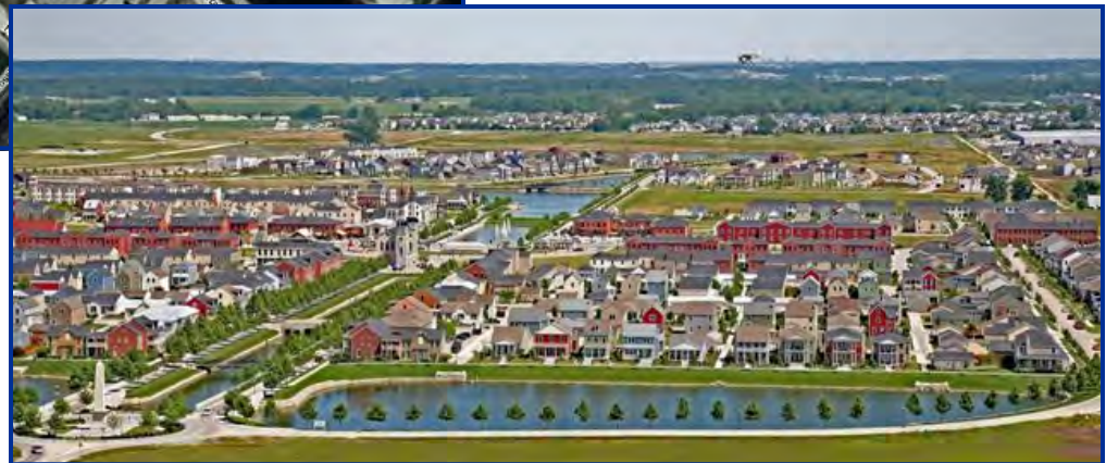
Aerial Views of New Town