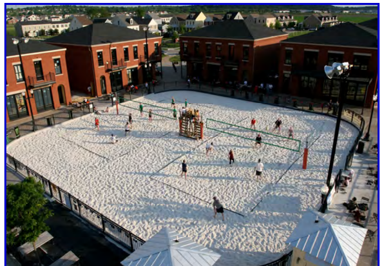
Volleyball Courts in Front of Restaurant