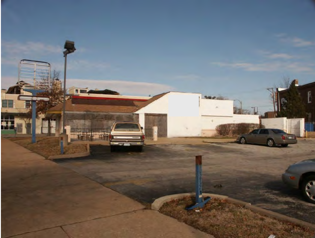
VIEW OF THE S. JEFFERSON CURB CUT